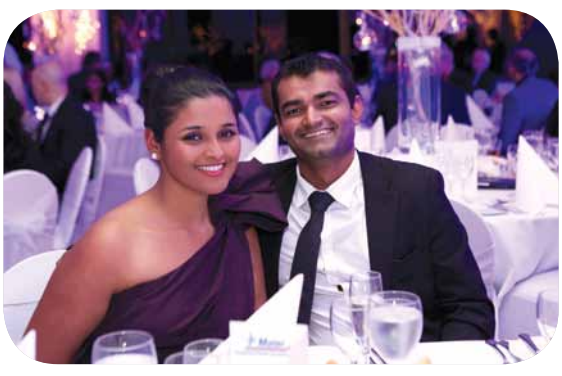
> Above: GPs and their guests enjoying the Winter Wonderland Gala Dinner.